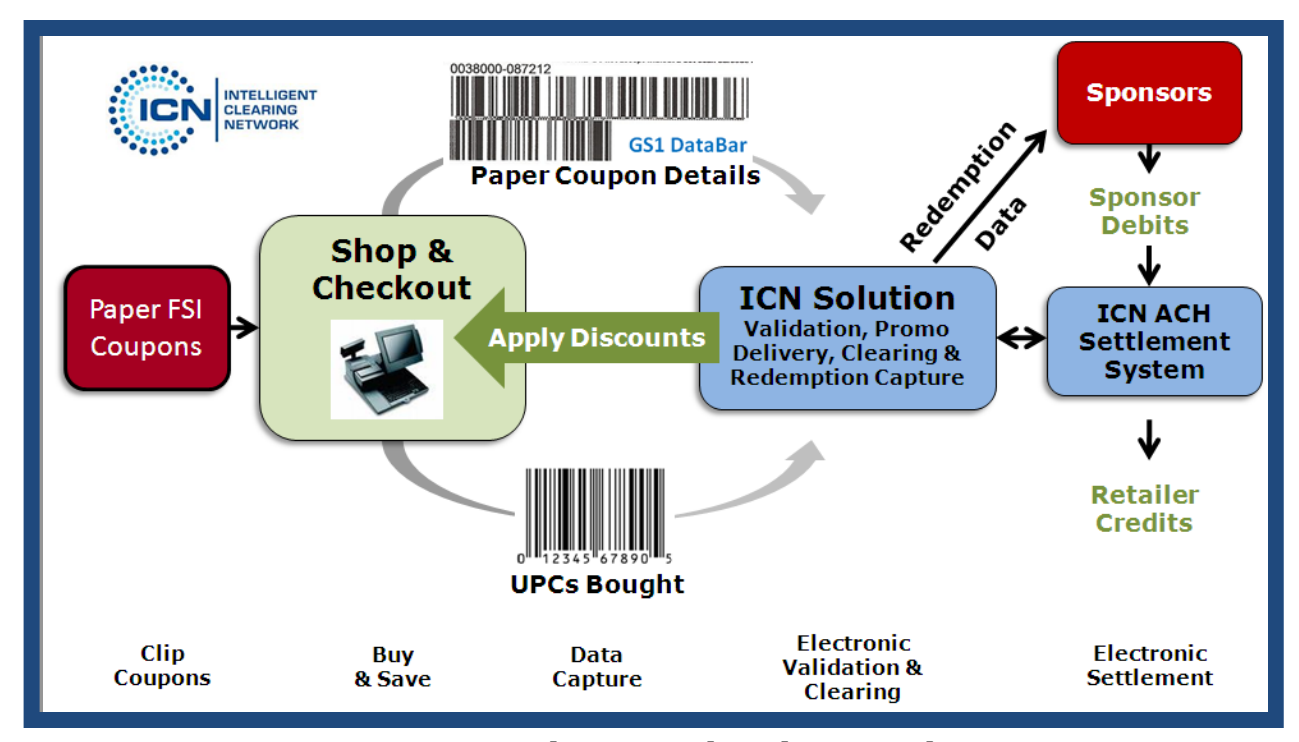
Turn-Key Paper Clearing and Settlement Solution

Digital offers, whether these are delivered via the web, email, mobile devises, or in-store, including those that customers opt into through "Load to Loyalty Card" features are cleared electronically at the POS. Digital opt-in offers are pre-defined in ICN's solution and upon receiving offer activations in real time, ICN awaits the scan of the customer's loyalty card at checkout, and then validates offers against actual purchases in order to clear and settle these incentives. (No downloading and uploading of files to the POS)